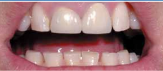
Bruxing can wear down and destroy your teeth.

Do you wake up with a stiff, tired jaw? Are your teeth sensitive to cold drinks? If you answered yes to either of these questions, you may be grinding or clenching your teeth during sleep. Grinding of the teeth is a medical condition called bruxism. Over time, bruxism will result in the wearing down of your natural tooth enamel. In fact, studies suggest that those who grind and clench their teeth experience up to 80 times the normal wear per day compared with those who do not.